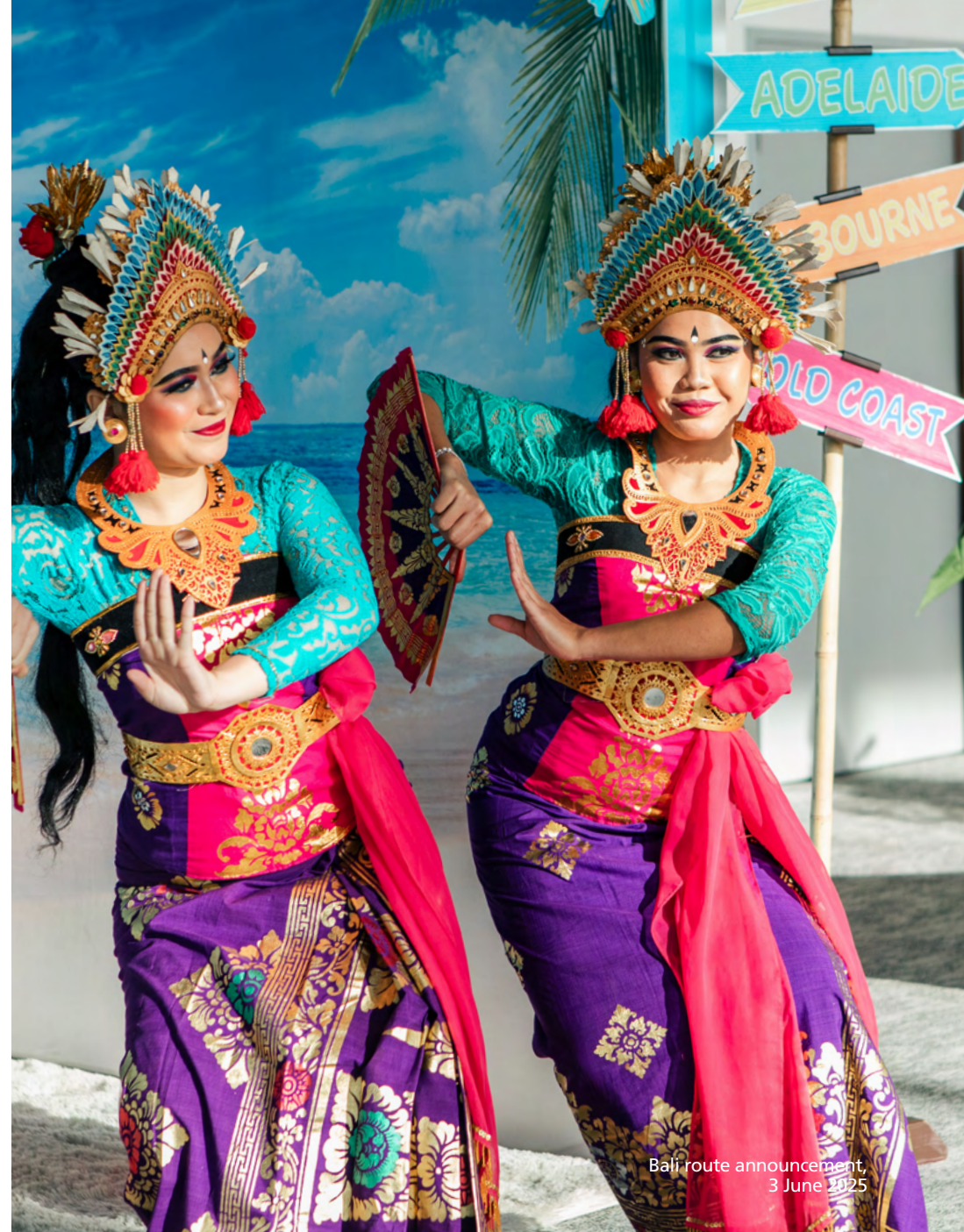
Bali route announcement, 3 June 2025

Chief Executive Officer, Newcastle Airport