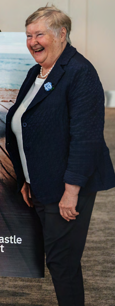
Perth route announcement, 28 May 2025